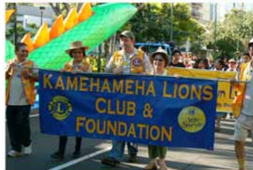
Annual Liliha-Palama Christmas Parade