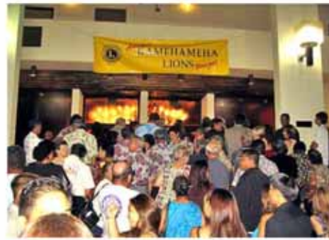
Annual "Laughs For Lions" Fundraiser

To encourage service-minded men and women to serve their community without personal financial reward, and to encourage efficiency and promote high ethical standards in commerce, industry, professions, public works and private endeavors.